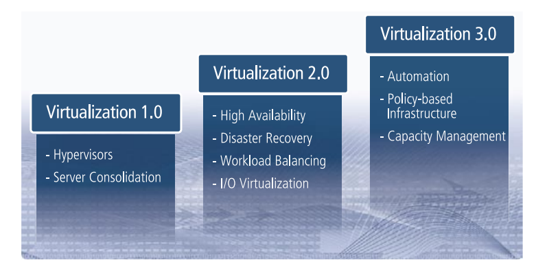
Figure 2: Virtualization Evolution

Strategic virtualization begins with Virtualization 2.0 (Figure 2). Here, high availability, disaster recovery, and workload management begin to yield a reduction in the slope of the complexity curve. Still, invoking these management operations often requires complicated Run Book steps comprised of manual intervention and network reconfiguration, along with a bit of good fortune. In the case of equipment failure or a site disaster, such complexity could have a devastating effect on business processes, revenue, and corporate reputation.